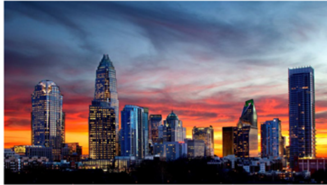
Above, the Charlotte skyline.