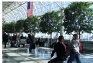
Below, Charlotte Douglas Airport.