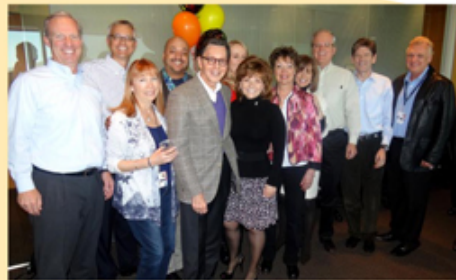
Ratified and signed! All smiles after the newly ratified agreement was signed by US Airways and Association of Flight Attendants leaders.