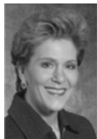
Dr. Judith Rodin (Age 64) First elected a director in 1997

President, The Rockefeller Foundation, New York, New York, since March 2005; private philanthropic institution. From 1994 to 2004, Dr. Rodin was President of the University of Pennsylvania. Dr. Rodin is also a director of Citigroup Inc. and Comcast Corporation.